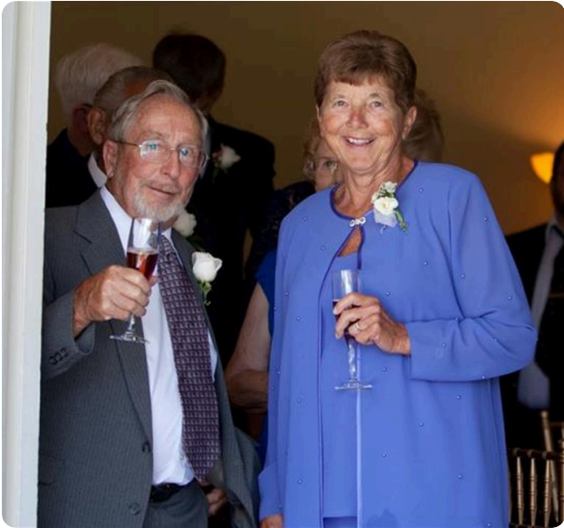
A happy couple!