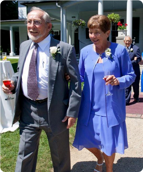
Enjoying the wedding! We were glad you were there!