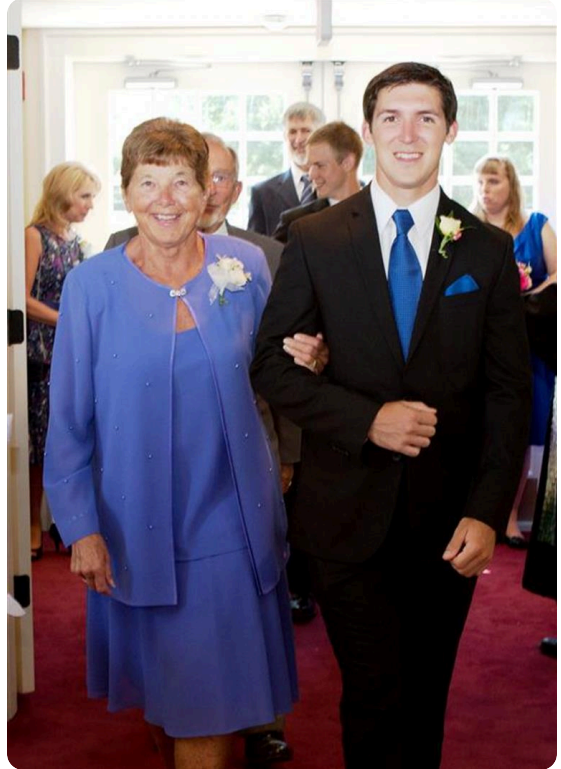
More pictures from the wedding